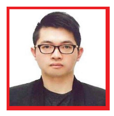
Vice Dean Faculty of Engineering, Technology and Built Environment UCSI University Kuala Lumpur, Malaysia

For More Details: https://wcaset.com/kuala-lumpur/advisory-committee.php