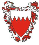
الهيئة الوطنية للنفط والغاز National Oil & Gas Authority