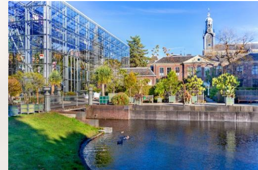
The botonical gardens