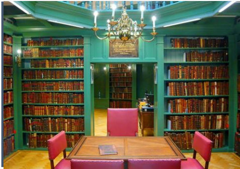
Jewish historical meuseum