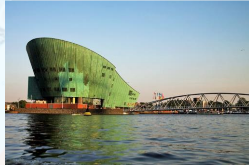
NEMO Science Museum