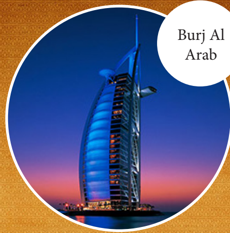
Burj Al Arab