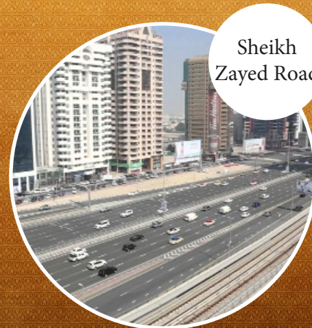
Sheikh Zayed Road