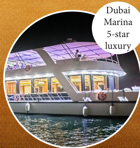
Dubai Marina 5-star luxury