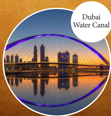
Dubai Water Canal