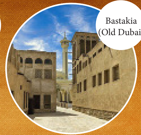
Bastakia (Old Dubai)