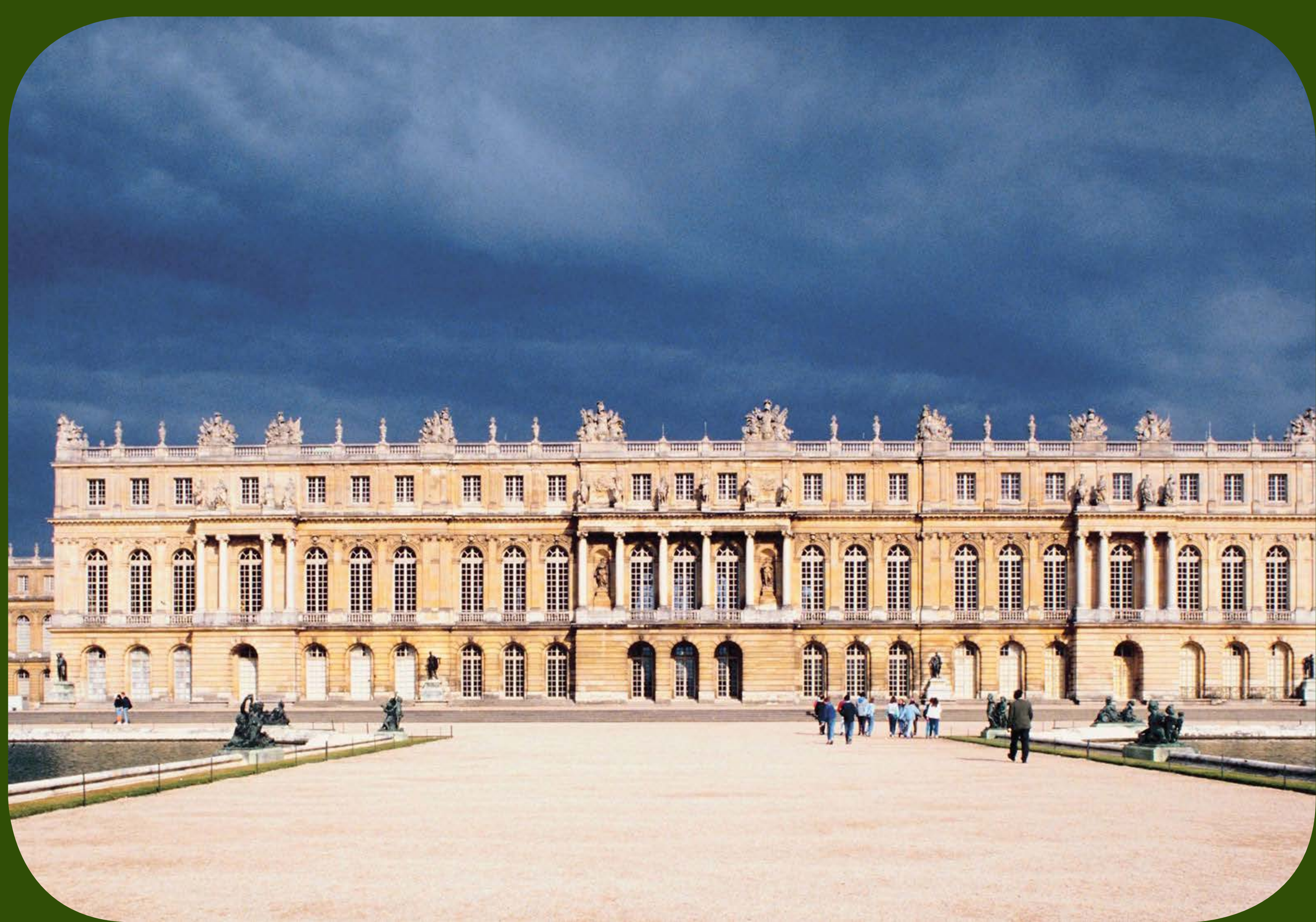
palace of versailles