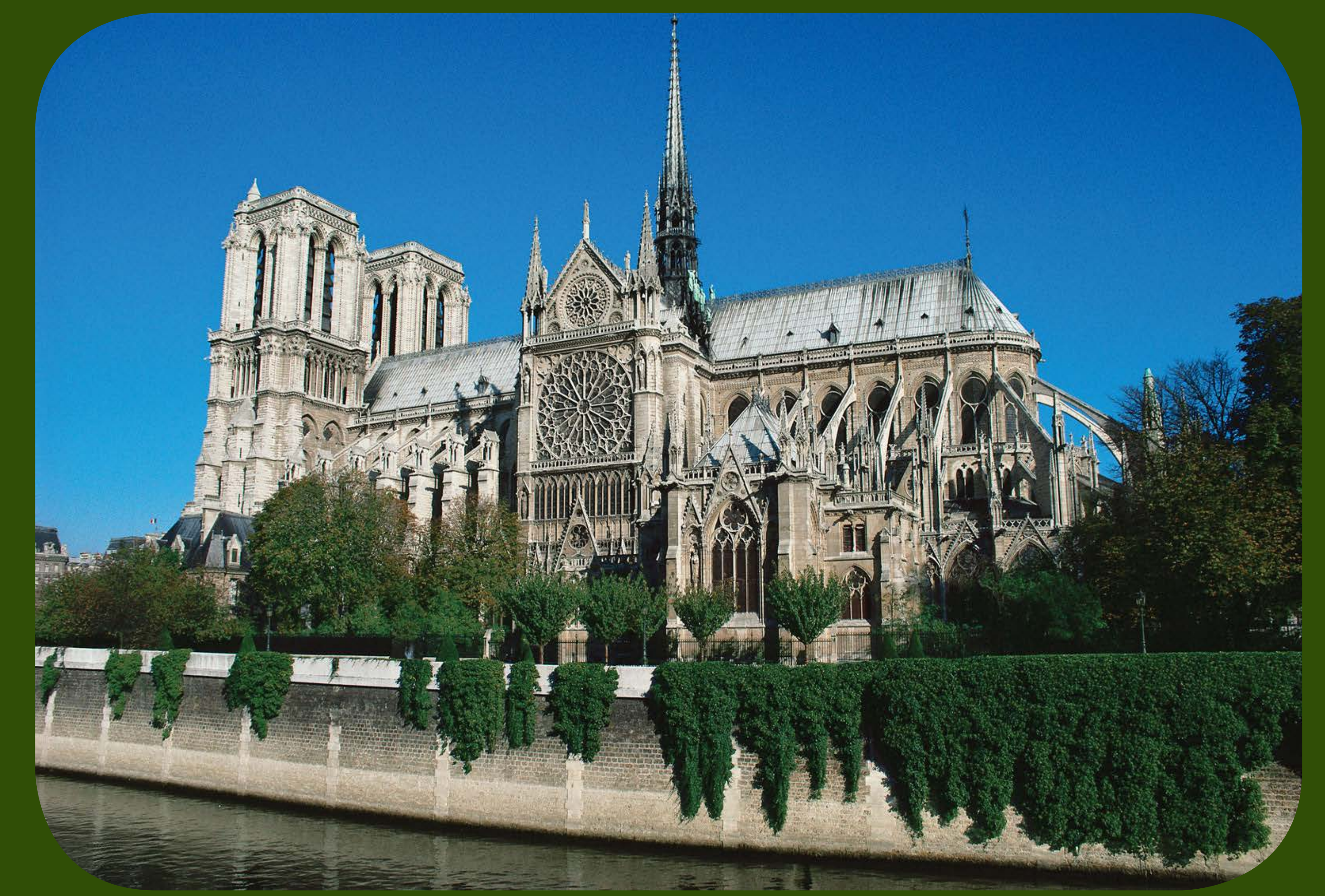
Notre Dame Cathedral