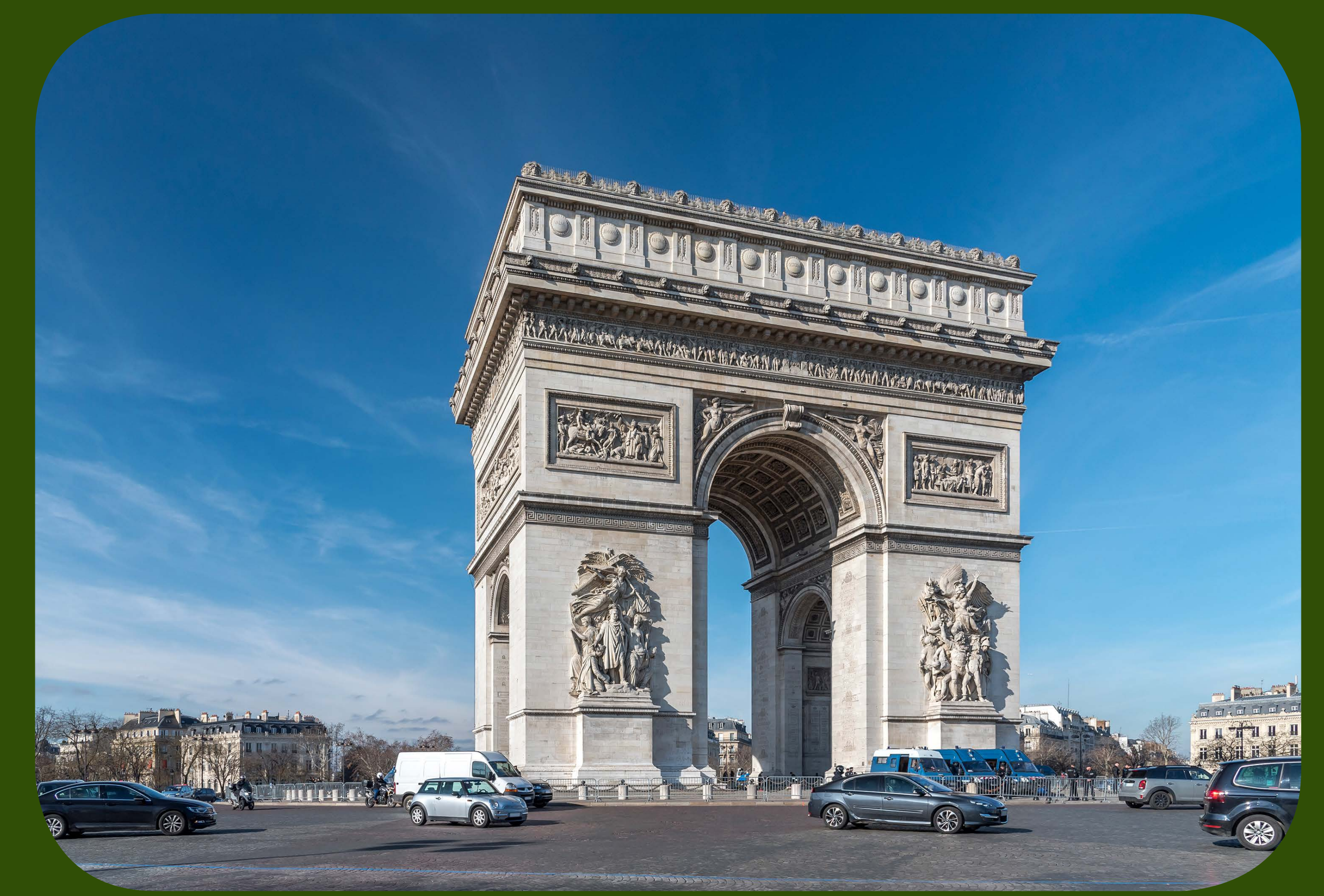
Arc of Triumph