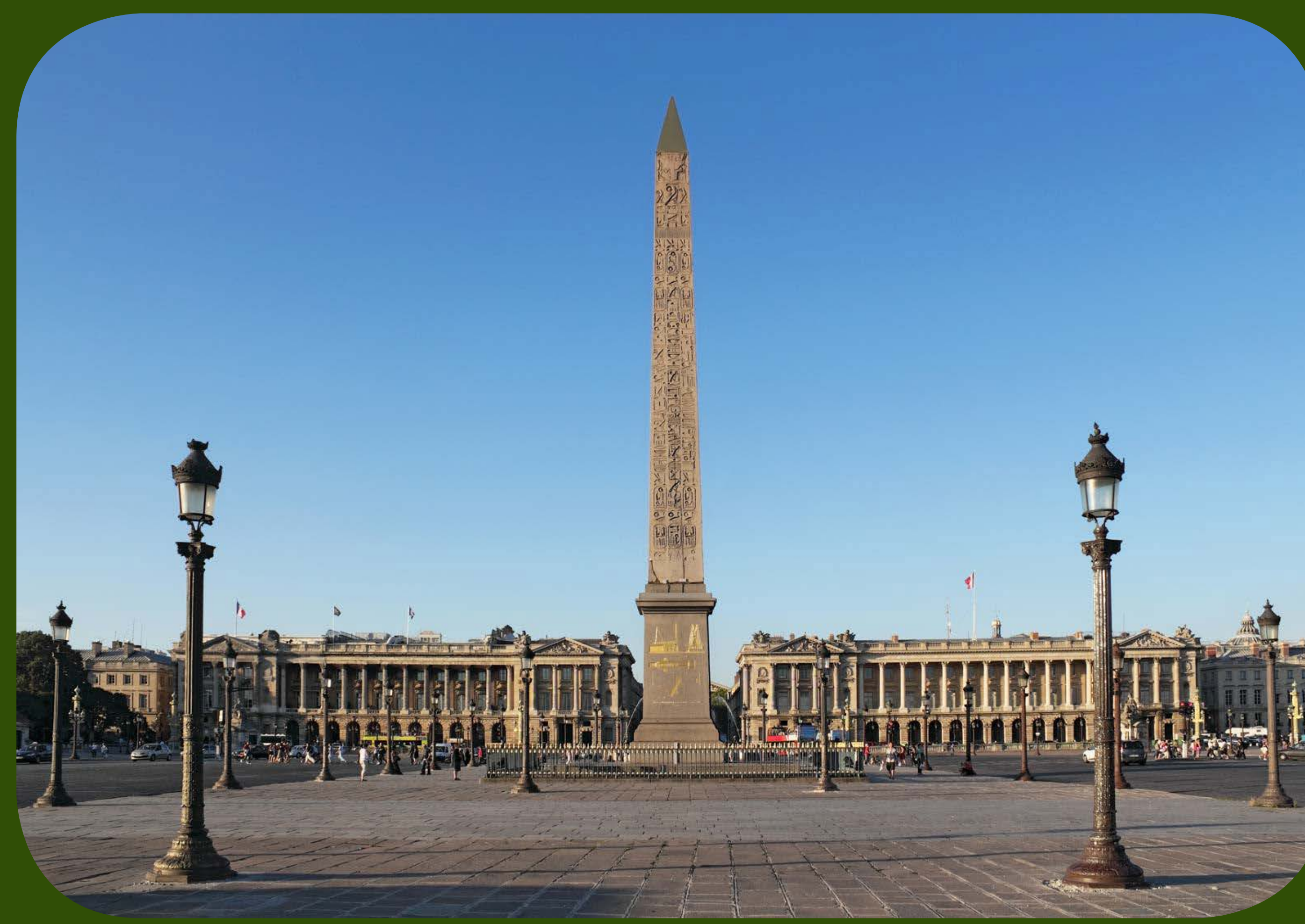
place de la concorde