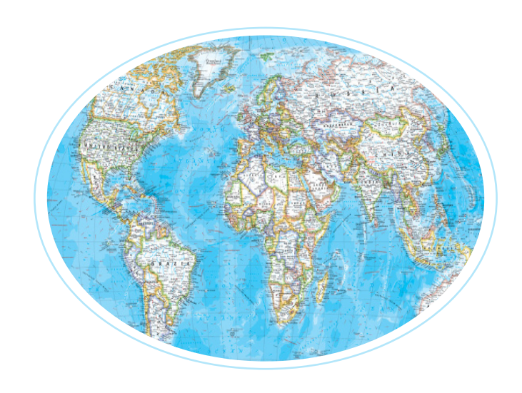
Venue & Accommodation