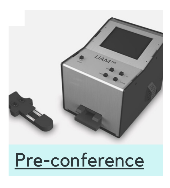
Chairside saliva-based tests