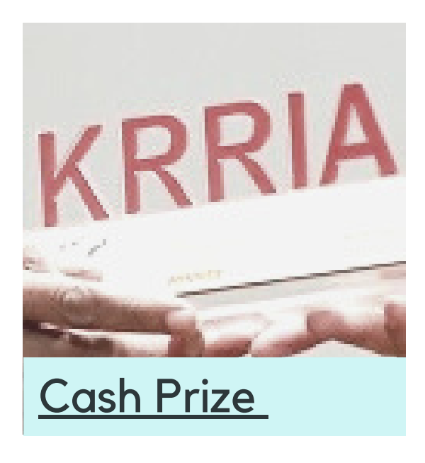
search Idea Award