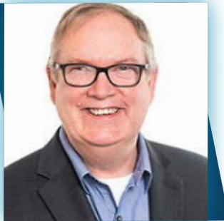
Charles Boicey Clearsense, LLC , USA