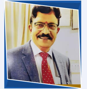
L C Madharia Ashirwad Laser & Phaco Eye Hospital & Daibetic Centre, India