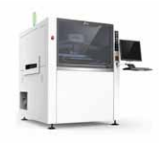
2nd-hand equipment Sale Hall