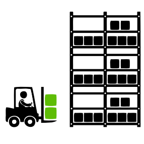
Inventory Clearance Hall