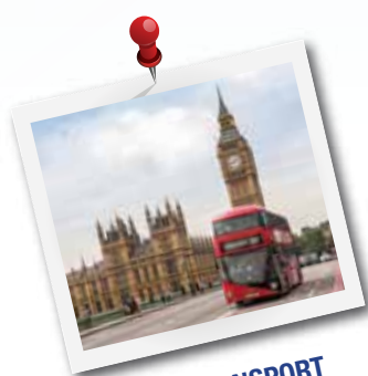
THE TRANSPORT OF LONDON