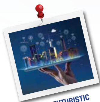
THE FUTURISTIC SMART CITY OF INDIA