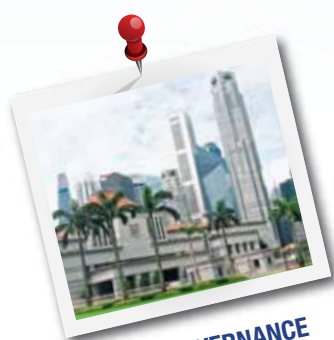
THE GOVERNANCE OF SINGAPORE