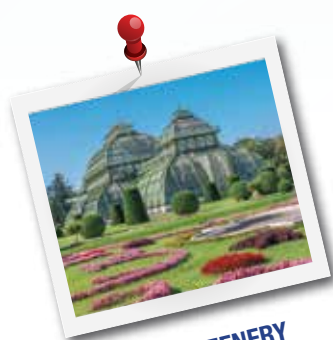
THE GREENERY OF VIENNA