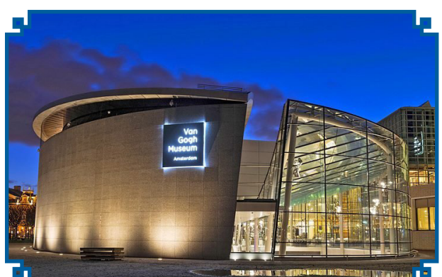
Van Gogh Museum 3