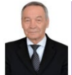
Emil Mukhamejanov International Institute of Gerontology kazakhstan