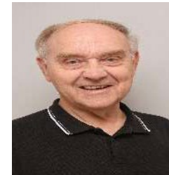
Claude Billeaud University Hospital Center of Bordeaux, France