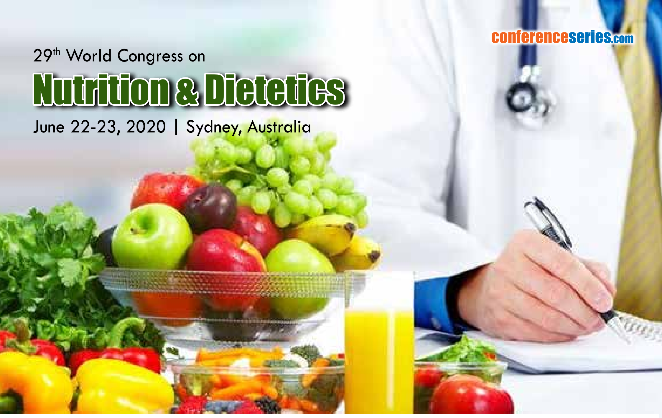
Theme: Exploring Nutritional Innovations in Malnourished Obese World