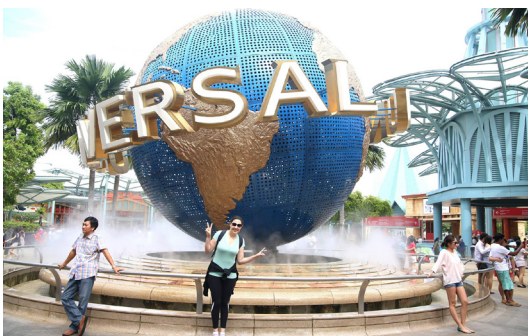
Universal Studios Singapore