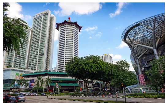
Night Safari Singapore