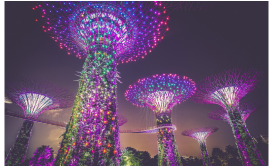
Gardens by the Bay