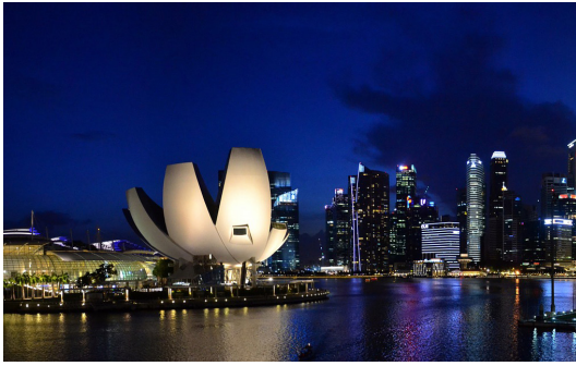
Marina Bay Sands