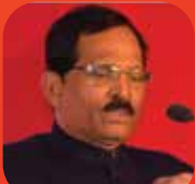
Shri. Shripad Yesso Naik

Union Minister of State for Health & Family Welfare Govt. of India