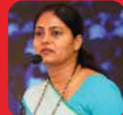
Smt. Anupriya Patel

Former Minister of State for Parliamentary Affairs, Govt. of India