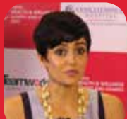
Ms. Mandira Bedi