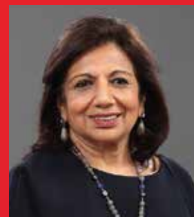
Ms. Kiran Mazumdar Shaw Chairman & MD, Biocon Limited