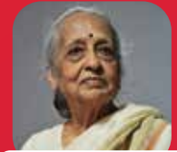
Dr. Viswanathan Shanta