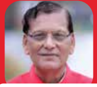
Dr. Bindeshwar Pathak

Chairperson, Global Alliance for Improved Nutrition