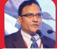
Dr. Indu Bhushan

Former Minister of Water, Tourism & Culture Govt. of India