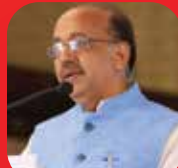
Shri. Vijay Goyal

Minister of State for Agriculture & Farmers Welfare