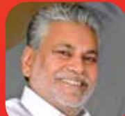
Shri. Parshottam Rupala

Minister of State for AYUSH (I.C.), Govt. of India