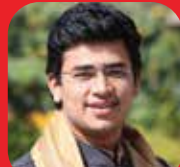
Shri. Tejasvi Surya