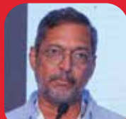
Mr. Nana Patekar