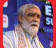
Shri. Ashwini Kr. Chaubey

Union Minister of State for Micro Small and Medium Enterprises, Govt. of India