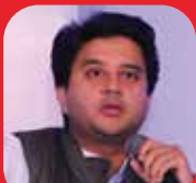
Mr. Jyotiraditya Scindia