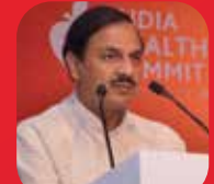
Dr. Mahesh Sharma

Former Minister of State for Health & Family Welfare Govt. of India