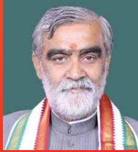
Shri Ashwini Kr. Choubey Minister of State for Health and Family Welfare, Govt. of India