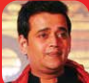
Shri. Ravi Kishan

Former Minister of State for Culture Tourism, & Civil Aviation, Govt. of India