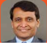
Shri. Suresh Prabhu

Former Minister of Commerce and Industry