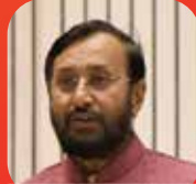
Shri. Prakash Javadekar

Union Minister for Road Transport & Highways, Govt. of India