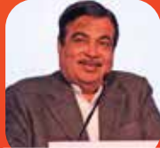
Shri. Nitin Gadkari

Former Minister of Commerce and Industry