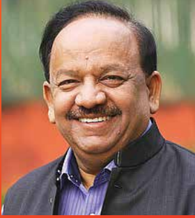
Dr. Harsh Vardhan Minister of Health & Family Welfare, Govt. of India