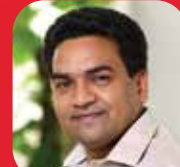
Mr. Kapil Mishra

Minister of Health Govt. of NCT of Delhi