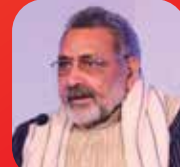
Shri. Giriraj Singh

Minister of Environment, Forest and Climate Change Govt. of India