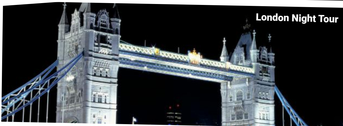
London Night Tour