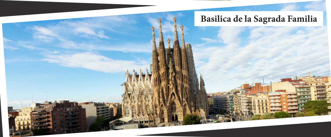
Basilica de la Sagrada Familia