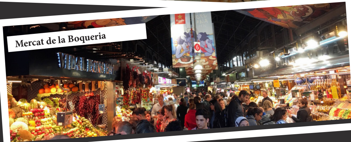
Mercat de la Boqueria