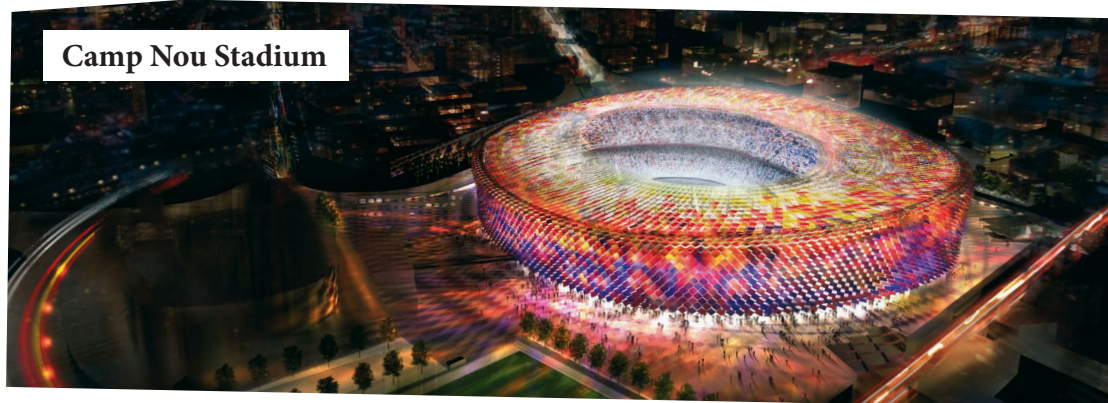
Camp Nou Stadium