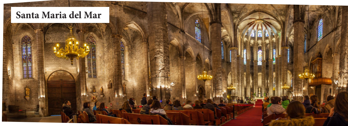
Santa Maria del Mar