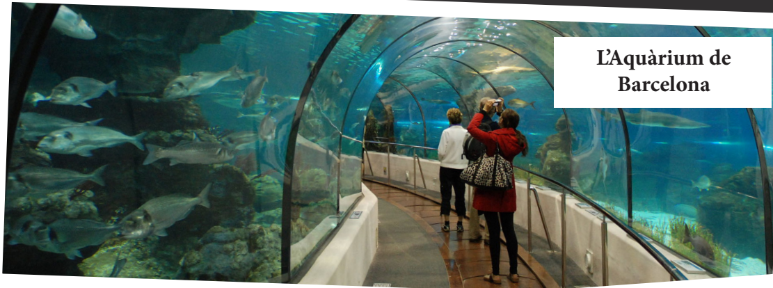
L'Aquàrium de Barcelona