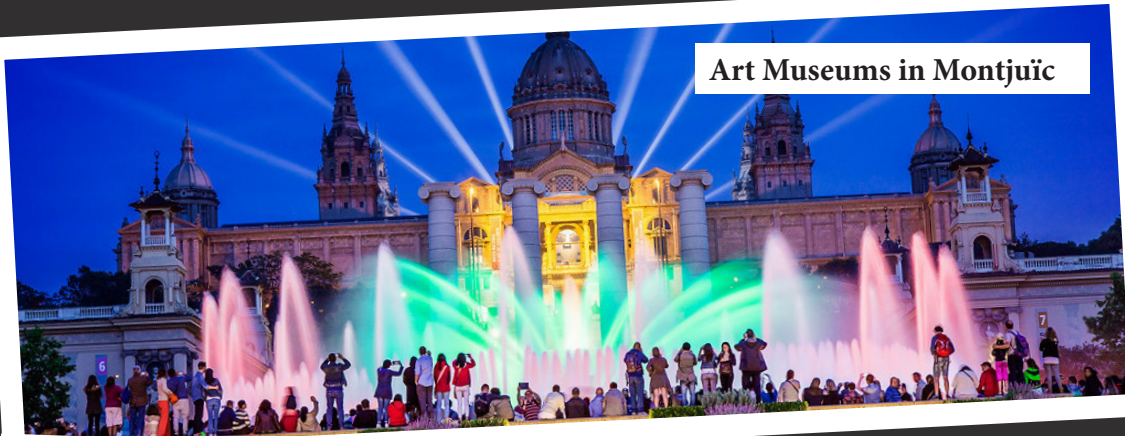
Art Museums in Montjuïc