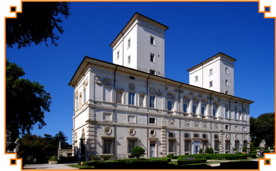
Borghese Gallery and Gardens