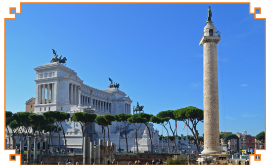
Piazza del Popolo