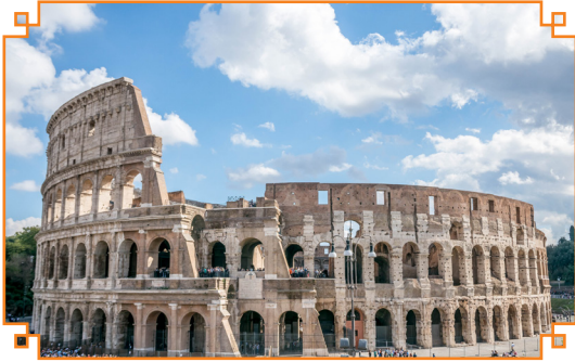
Colosseum and the Arch of Constantine