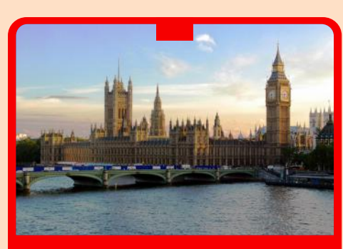
Palace of Westminster