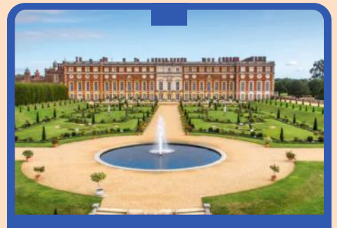
Hampton Court Palace