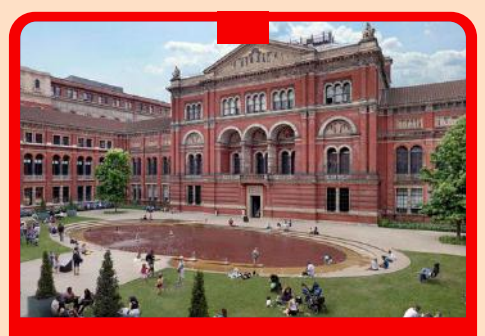
Victoria and Albert Museum