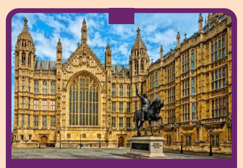
Whitehall and Parliament