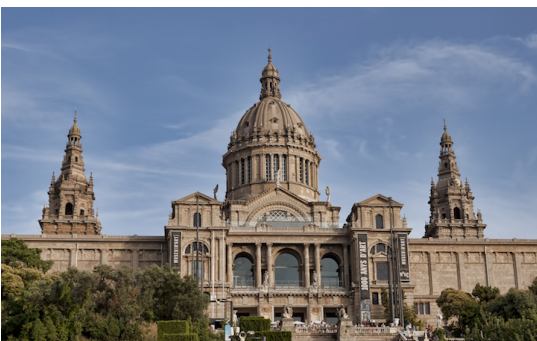
Museu Nacional d'Art de Catalunya