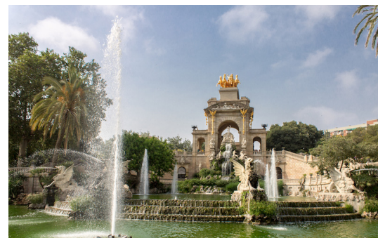
Parc de la Ciutadella