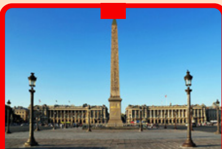
Place de la Concorde