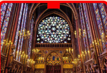
Musical Concerts at Sainte Chapelle