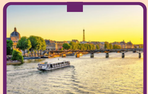
Seine River Cruises