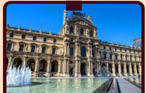
Musée du Louvre