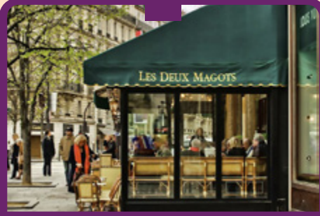
Bustling Boulevards and Legendary Cafés