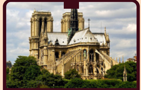
Cathédrale Notre Dame de