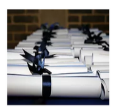
Participatory certificate and listing in the nomination compendium