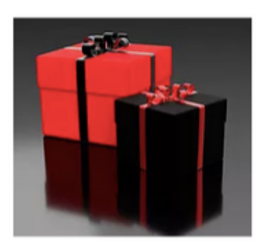
All accepted participants receive free products and services up to 1 lakh