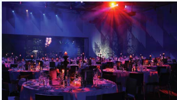
Gala Dinner Sponsor