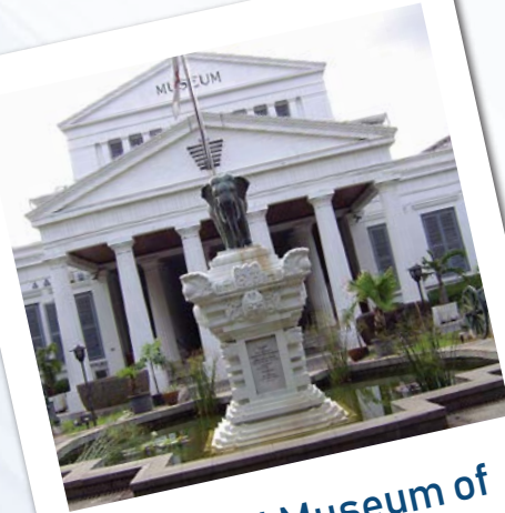
National Museum of Indonesia