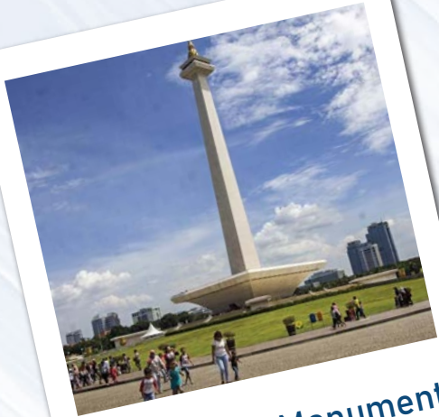
The National Monument

26 TH -27 TH NOV 2019 | JAKARTA, INDONESIA