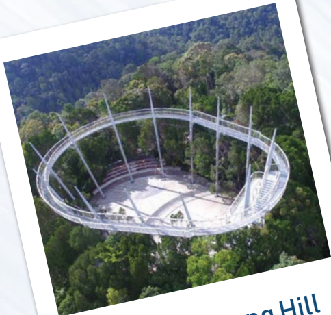
Habitat Penang Hill