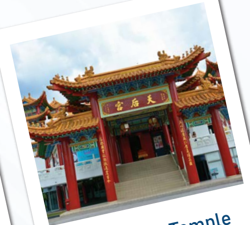
Thean Hou Temple