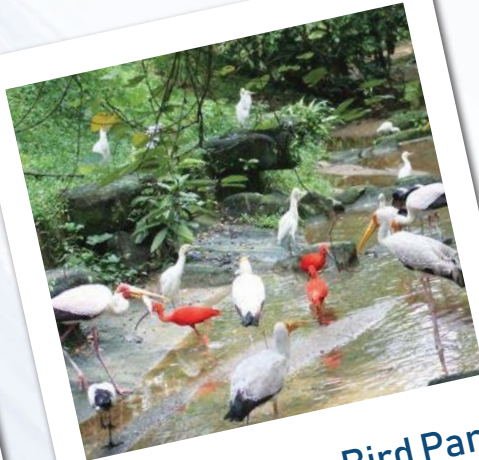
Kuala Lumpur Bird Park