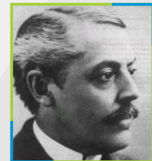
Colonel Eli Lilly Founder of Eli Lilly United States