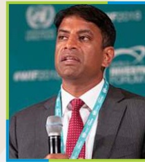
Vasant Kalathur Narasimhan CEO of Novartis. United States