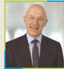
Philip Roy Hampton Chairman of GlaxoSmithKline. United Kingdom