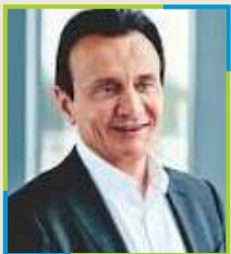
Pascal Soriot CEO of AstraZeneca France