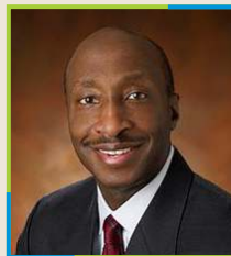
Kenneth Frazier Chairman and CEO of Merck & Co United States