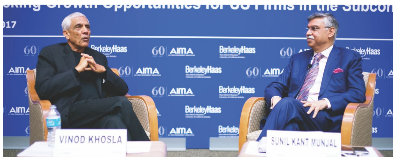
▲ (L - R) Vinod Khosla, Founder, Khosla Ventures and Sunil Kant Munjal, Conference Chairman and Chairman, The Hero Enterprise at the 2nd US-India Conference