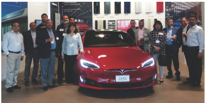
▲ AIMA CEOs delegation visit to the Tesla factory

Previous CEOs delegations visited Silicon Valley's most valuable and innovative companies such as Apple, NASA Ames Research Center, Facebook, Tesla, Google X, Verily Life Sciences, Byton, AutoDesk, Gilead Sciences; NVIDIA Corporation, IBM, Apollo Fusion, Plug and Play Tech Center, Stanford University Campus amongst others.