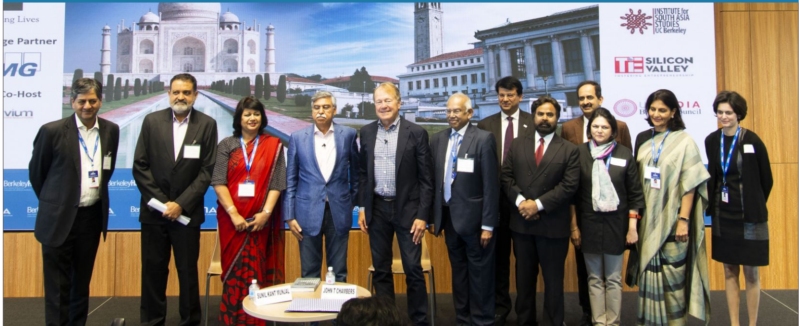
▲ John T Chambers, Founder and CEO, JC2 Ventures and Chairman Emeritus, Cisco with the AIMA delegation at the 3rd US India Conference