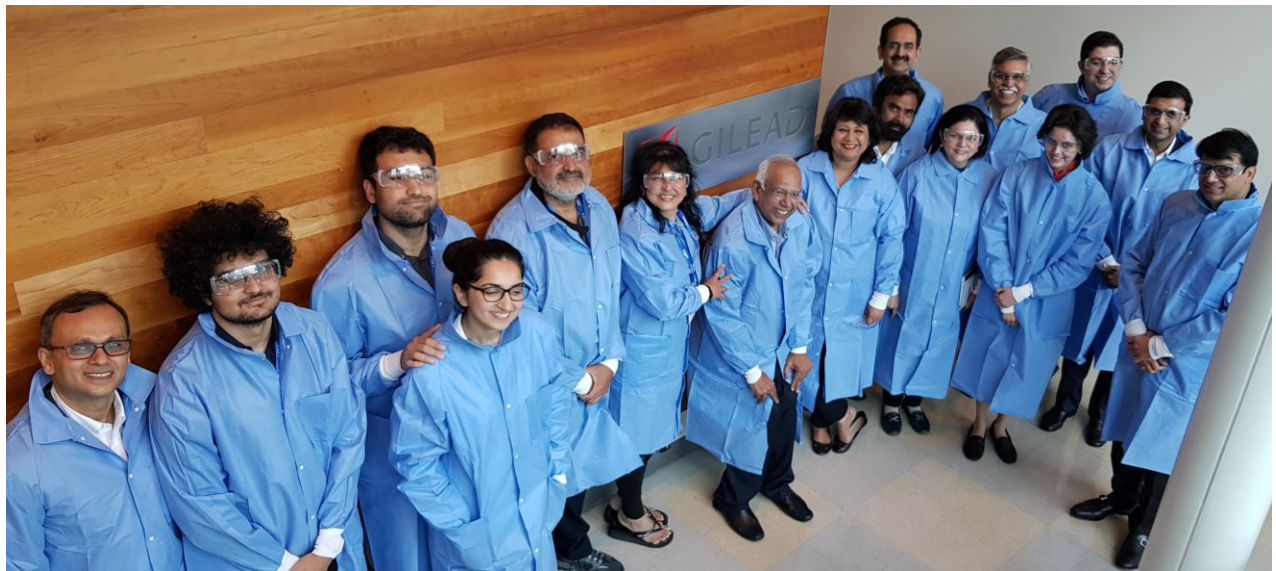
▲ AIMA CEOs delegation visit to Gilead Sciences