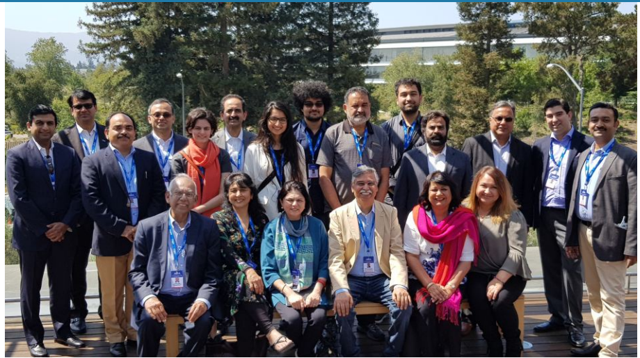
▲ AIMA CEOs delegation visit to Apple