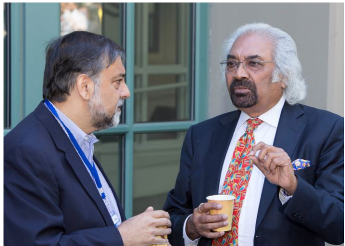
▲ Vivek Wadhwa, Distinguished Fellow at Harvard Law School and Carnegie Mellon University's College of Engineering and Sam Pitroda, Telecom Inventor, Entrepreneur and Policy Maker at the 1st US-India Conference