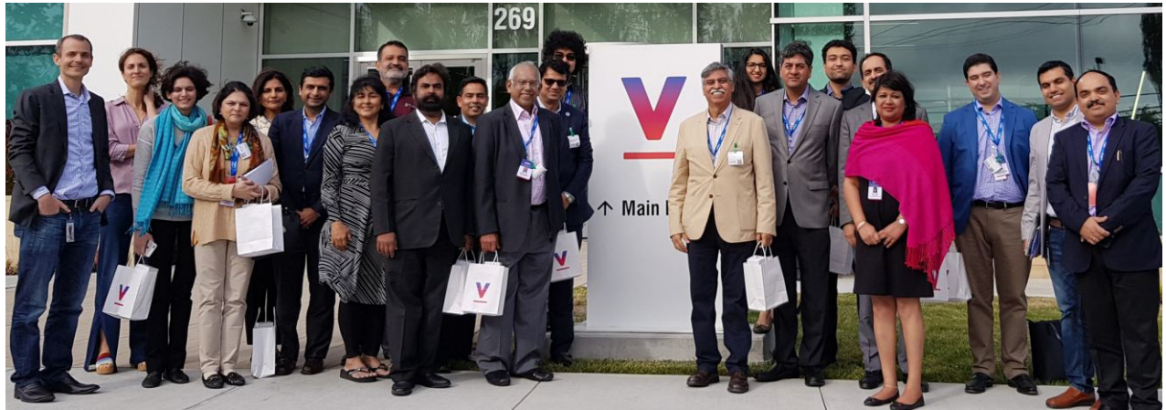
▲ AIMA CEOs delegation visit to Verily Life Sciences