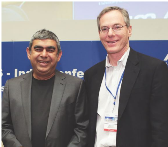
▲ (L-R) Vishal Sikka, then CEO, Infosys Ltd and Paul E Jacobs, Executive Chairman, Qualcomm Incorporated at the 1st US-India Conference