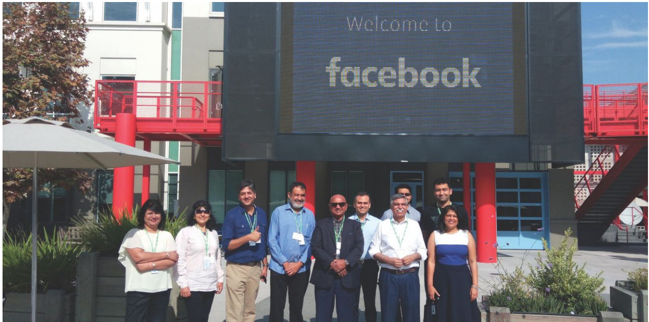
▲ AIMA CEOs delegation at Facebook headquarters

AIMA will also organise a CEOs delegation which will visit iconic Silicon Valley companies, to understand the rapid strides being made by some of the most innovative and technology driven enterprises. The delegation will include CEOs and industry captains from diverse sectors.