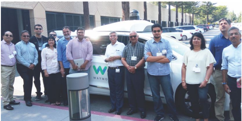
▲ AIMA CEOs delegation at Google X office in front of the Google self-driving car