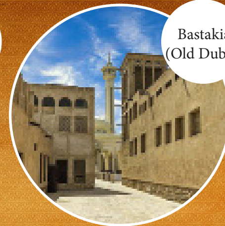
Bastakia (Old Dubai)