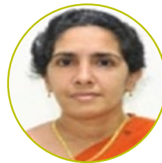
Lucyamma Joseph Govt. College of Nursing India