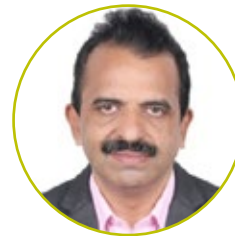
Yacob Mathai Marma Health Centre India