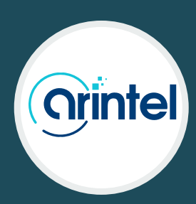
TBA Arintel Technologies