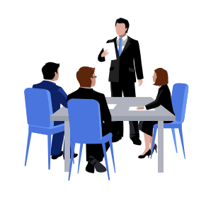
SUCCESS STORIES & CASE STUDIES