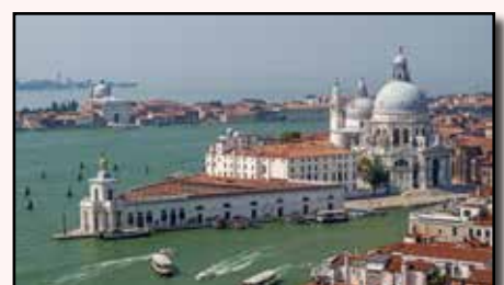
Basilica di Santa Maria della Salute