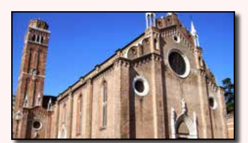
Basilica dei Frari

Venice is a city in north-eastern Italy and the capital of the Veneto region. It is situated on a group of 118 small islands that are separated by canals and linked by over 400 bridges. The islands are located in the shallow Venetian Lagoon, an enclosed bay that lies between the mouths of the Po and the Piave rivers (more exactly between the Brenta and the Sile). In 2018, 260,897 people resided in the Comune di Venezia, of whom around 55,000 live in the historical city of Venice. Together with Padua and Treviso, the city is included in the Padua-Treviso-Venice Metropolitan Area (PATREVE), which is considered a statistical metropolitan area, with a total population of 2.6 million.