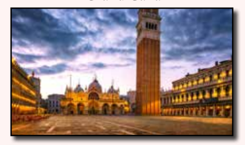
St. Mark's Square