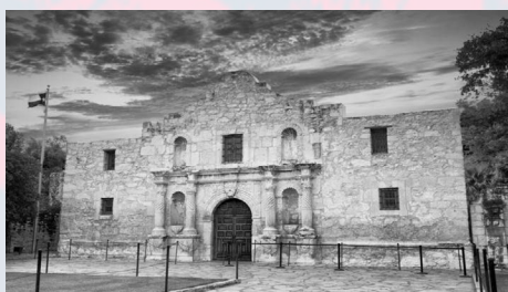
Battle of the Alamo

San Antonio is as comfortable as an old pair of jeans. It offers big-city amenities and world-renowned attractions coupled with a relaxed and inviting atmosphere. Most famously known as the home of the Alamo, the spirit of the region expands beyond its tourist labels, offering a community rich in Spanish and Old West heritage.