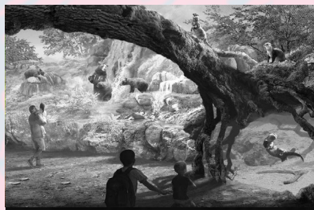
San Antonio Zoo