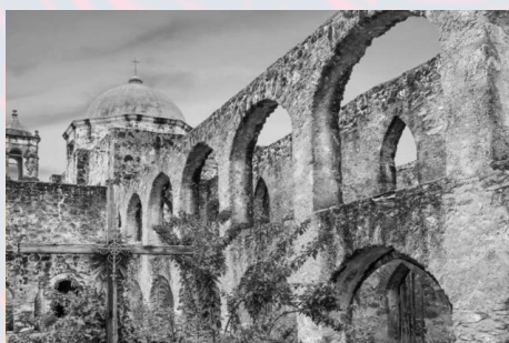
Missions National Historic Park