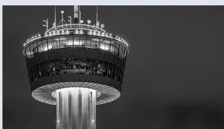
Tower of the Americas