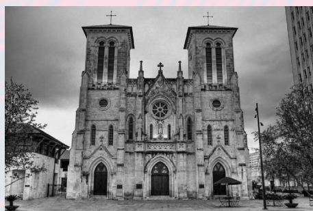
San Fernando De Bexar Cathedral