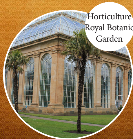
Horticulture Royal Botanic Garden