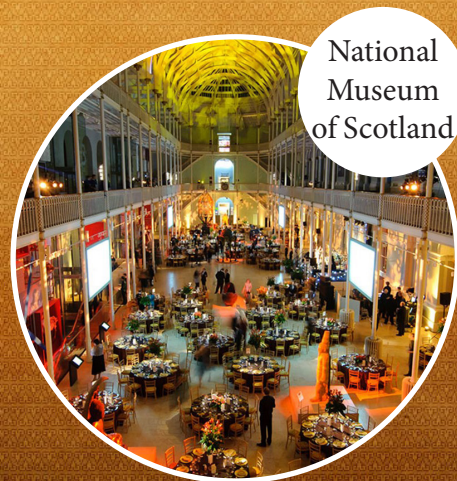
National Museum of Scotland