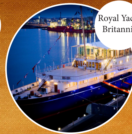
Royal Yacht Britannia