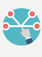
Image Processing and NLP Learn - Image Processing Basics Face Detection and Recognition Sentiment Analysis, Text Classification, Chatbots Projects: 1. Face Detection and Recognition 2. Live Social Media Sentiment Analysis 3. Sales support Chatbot