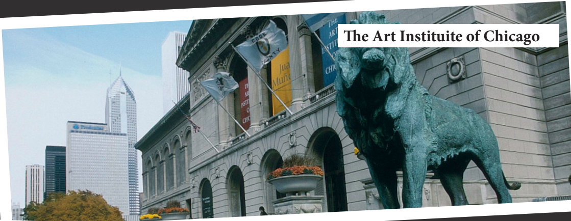
The Art Institute of Chicago