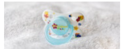
Free Baby Cot (subject to availability and/or upon request at the Hotel)