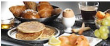
A delicious, generous breakfast buffet Served in the Parkside Diner restaurant