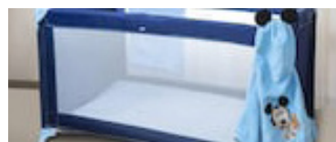
Free Baby Cot (subject to availability and/or upon request at the Hotel)