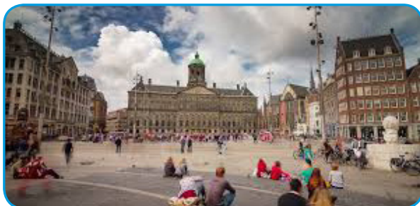
Royal Palace of Amsterdam