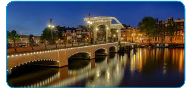
Magere Brug Drawbridge