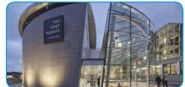
Van Gogh Museum