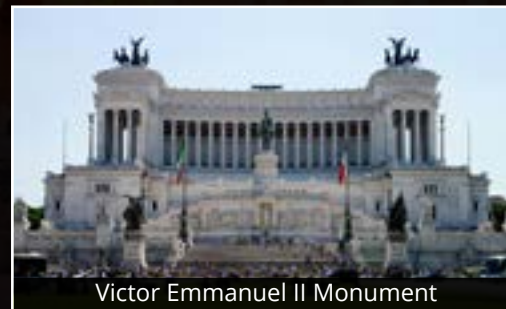
Victor Emmanuel II Monument