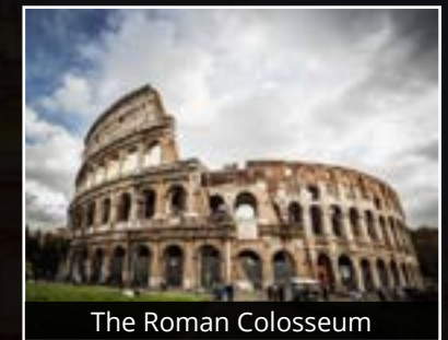
The Roman Colosseum