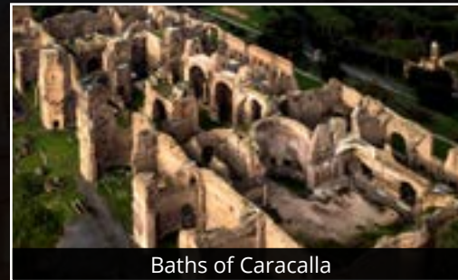
Baths of Caracalla