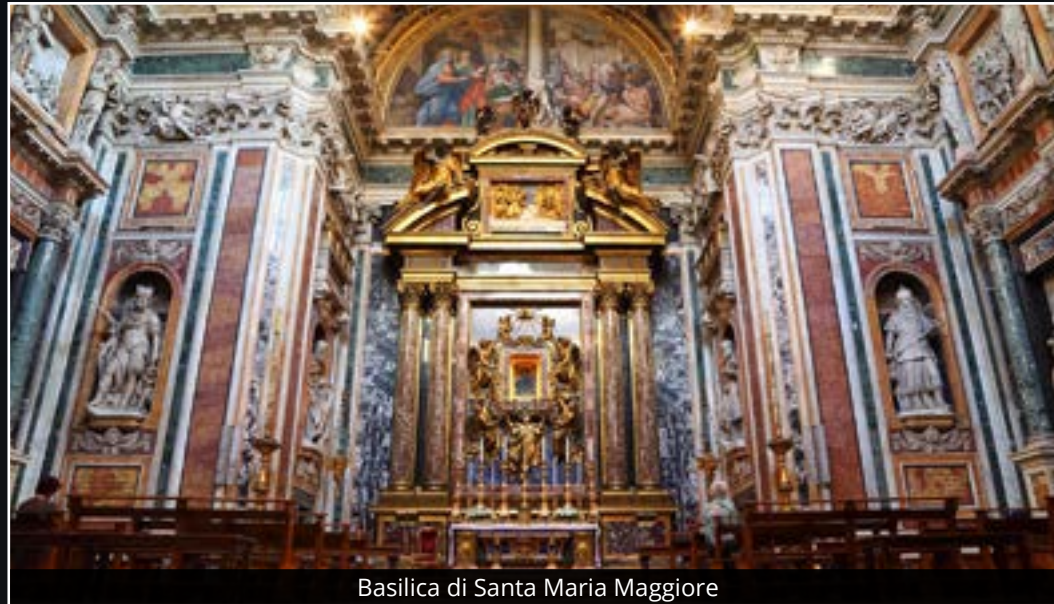
Basilica di Santa Maria Maggiore