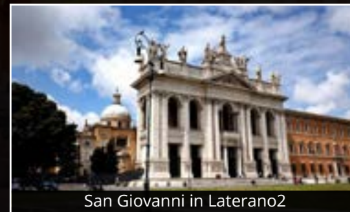
San Giovanni in Laterano2