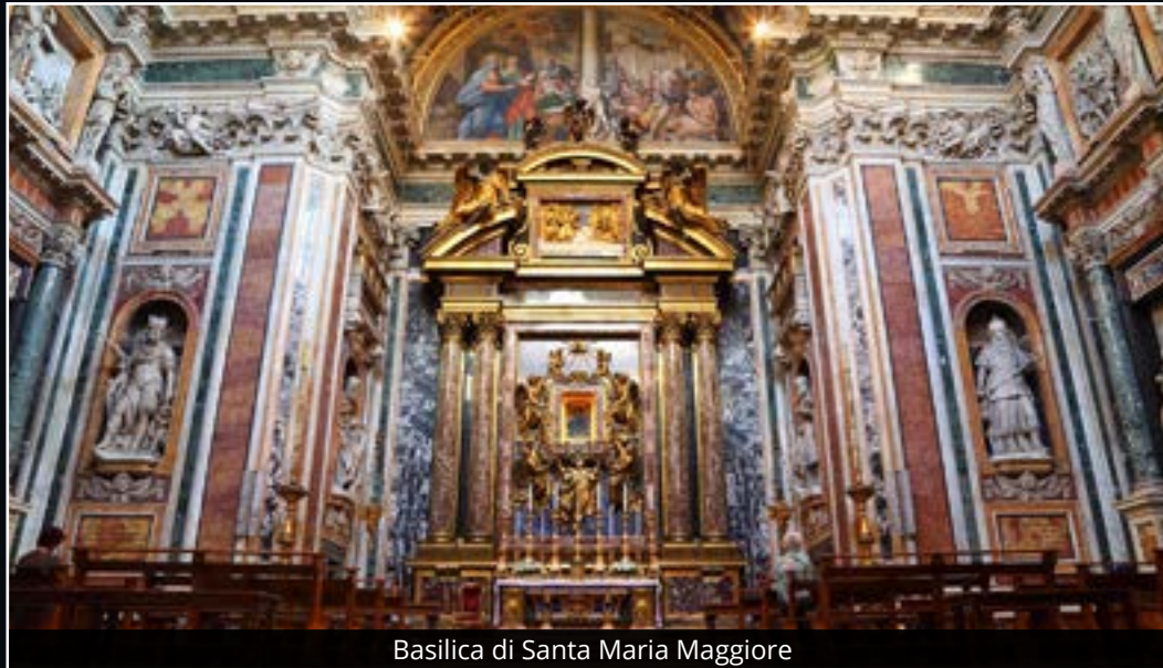
Basilica di Santa Maria Maggiore