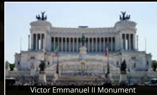
Victor Emmanuel II Monument