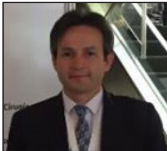
Nelson Rene Torales Hospital Central Argentina