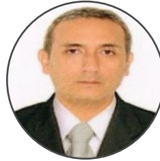
Carlos Augusto Yabar National Institute of Health Peru