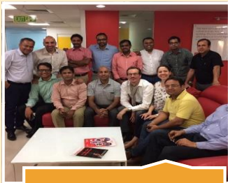
NLP for Sales