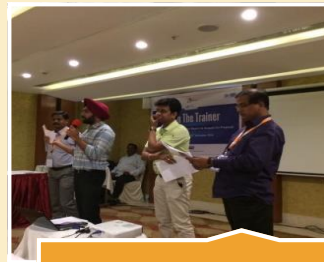
Train The Trainer