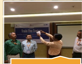
Train The Trainer