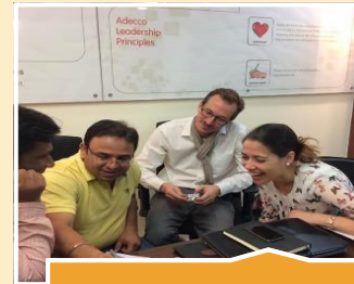
NLP for Sales