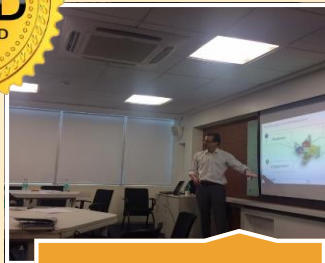
Train The Trainer