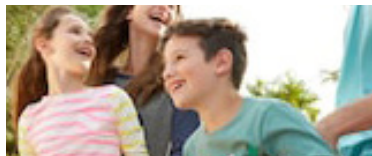
Special Kids' Menu Delight the pickiest of palates with a cast of family-friendly recipes for breakfast, lunch and dinner.