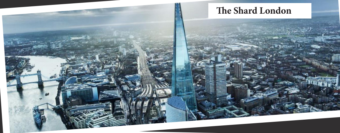
The Shard London