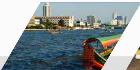
Chao pharya River & Waterways

Bangkok is also called as “Krung Thep” which implies “City of Angels” and is a famous tourist destination, visited by a large number of guests from all around the world. The city is the well-known tourist spot of the entire East Asia and represents a mix of tradition and modernity. Guests will appreciate its advanced skyscrapers, luxury hotels and shopping malls, alongside the traditional Thai culture that still retains its own charm. There are a lot of things to see and do in Bangkok; the city has impressive temples, galleries, showcases, shopping centers, various bars, night club and cinemas and also, there are numerous cultural attractions, for example, national museums, the Siam Society, the Thailand Cultural Center and the National Library. One of the most famous destinations is the floating market of Damnoen Saduak.