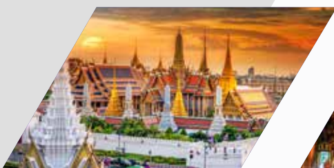
The Grand Palace