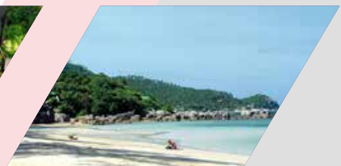
Hua Hin Beach