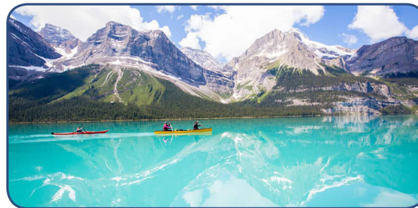
Jasper National Park