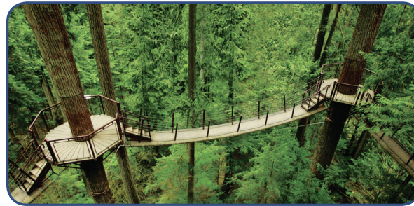
Capilano Suspension Bridge Park