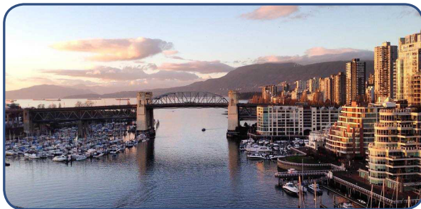
Granville Street Bridge