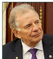
Zhores I. Alferov Nobel Laureate Russian Academy of Sciences, Russia