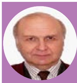
Vladimir V. Romyantsev National Academy of Sciences of Ukraine, Donetsk region, Ukraine