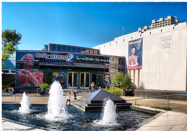
Houston Museum of Natural Science