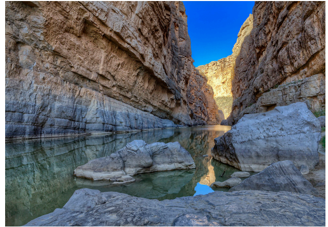
Big Bend National Park